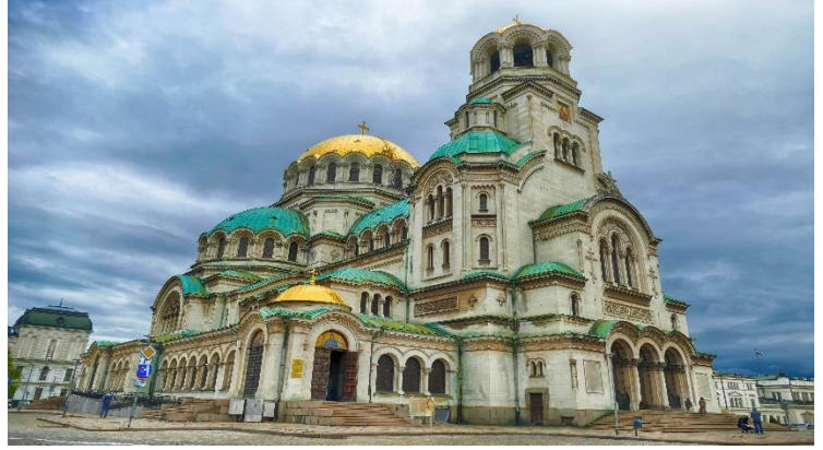
Overnight in Sophia (250 km)

7 Back across border to visit Edirne, the old capital of Ottoman empire. Visit Selimiye mosque and Beyazit complex which was medical school and hospital during Ottoman times and drive to Istanbul.